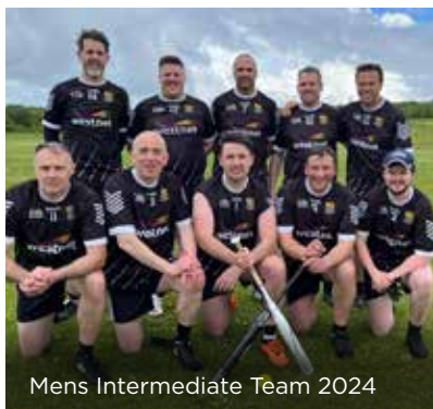
Mens Intermediate Team 2024