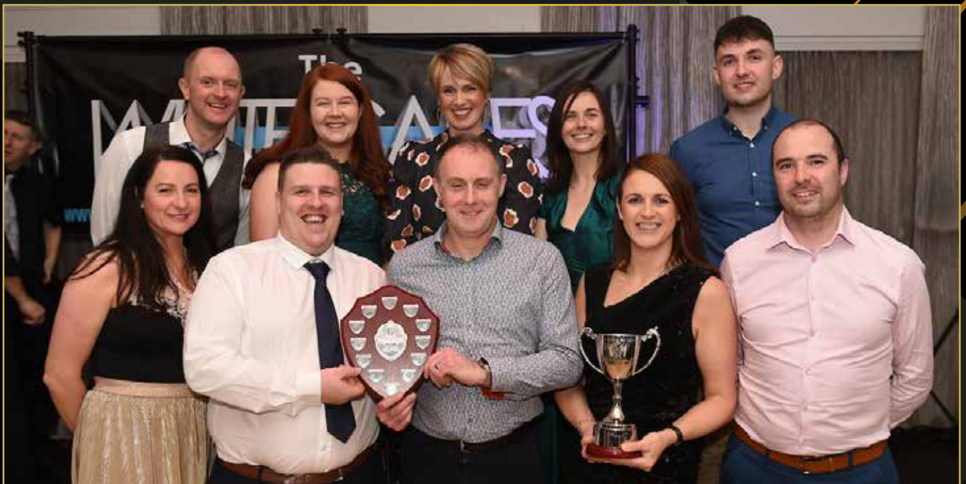
Kilmeena mixed rounders team celebrating their All-Ireland success