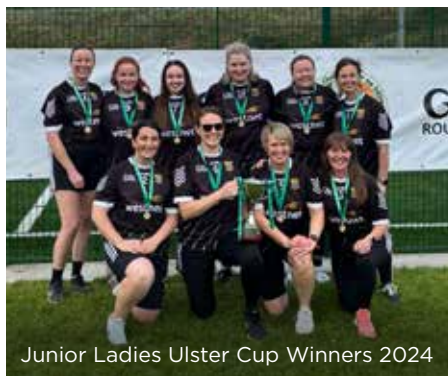
Junior Ladies Ulster Cup Winners 2024